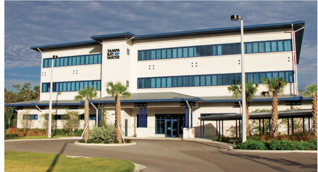
Administration Office, Clearwater, Florida