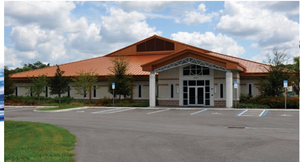
Infrastructure and Emergency Management Facility, Land O' Lakes, Florida

2575 Enterprise Road, Clearwater, Florida 33763 Pinellas: 727-796-2355 Hillsborough: 813-996-7009 Fax: 727-791-2388 www.tampabaywater.org